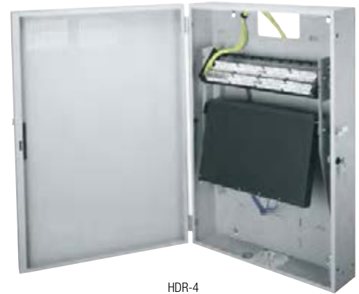
HDR-4 shown with equipment in service position