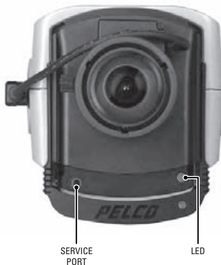
FRONT VIEW, CAMERA ONLY (OPENED TO EXPOSE SERVICE PORT)