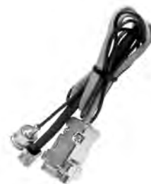
IPS-CABLE REMOTE MONITOR CABLE

The IPS-RDPE-2 remote data port brings all the functionality of the IPS-CABLE to ground level. The remote data port works with Spectra, ExSite, and Esprit Series systems. The IPS-RDPE-2 is compatible with coaxial video and UTP video control systems using Pelco D, Pelco P, or Coaxitron ® protocols.