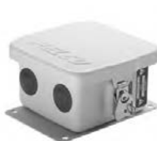
IPS-RDPE-2 REMOTE DATA PORT

The IPS-CABLE can be connected to a PC or PDA and monitor directly to the RJ-45 port of the IPS-RDPE-2 or the Spectra dome drive. The IPS-CABLE and the supplied software allow full control, setup, and upgrade capabilities. When used with an IPS-RDPE-2 , the IPS-CABLE also allows the user to control pan/tilt/zoom functions and program a Spectra, ExSite, or Esprit positioning system or any other system that accepts Pelco D protocol. It is compatible with most serial cable/connectors for Windows ® -based PCs.