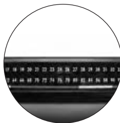
Temperature Strip Identify Temperatures within a particular range Accurate within +/- 1°C