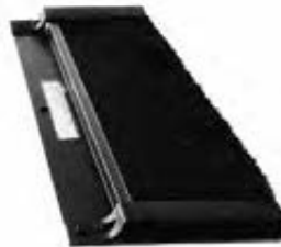
Extended Brush Raised Floor Grommet*, 2 Sizes For Large Cable Openings