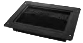
Integral Raised Floor Grommet*, 2 Styles For New Installations