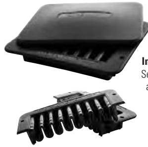
KoldLok Wave™ Split Integral Grommet and Cover Seals space around cables with a solid, flexible wave shaped thermoplastic elastomer material.