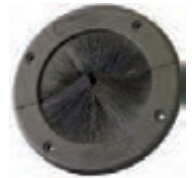
Round Grommet, 2 Sizes For Small Cable Bundles

Unsealed cable openings in access floor environments allow valuable conditioned air to bypass equipment. Bypass airflow contributes to hot spots, cooling unit inefficiencies and increased infrastructure costs. To reduce bypass airflow and improve data center cooling, block unsealed cable holes with KoldLok® Raised Floor Grommets.