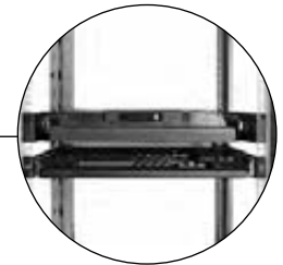
Uses minimal rack mounting space

Rack-mount keyboards and monitors make it easy to access equipment in a rack or cabinet. LCD Monitor+Shelf, Keyboard+Tray and Gold Contact Keyboard+Tray use only 3U of rack-mount space and will attach to 19"W EIA two-post or four-post racks, frames or cabinets.