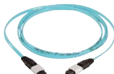
F ^ 12D5-5M‡