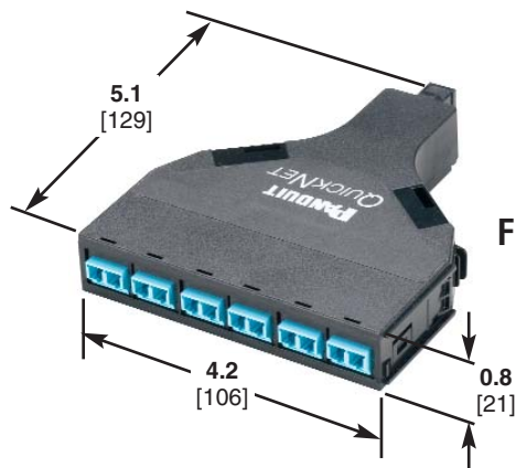
FQ ^ -12-10