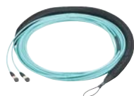
FSP ^ 2455F ^ AAA