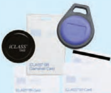
Images may not accurately reflect current credential.