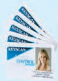
Available in 1K and 4K formats