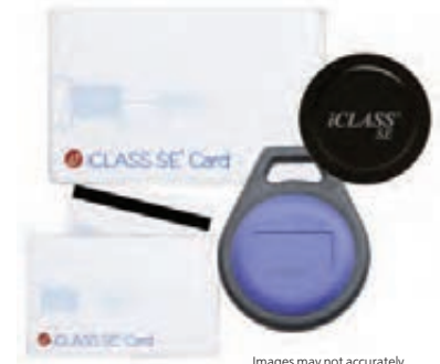
Images may not accurately reflect current credential.