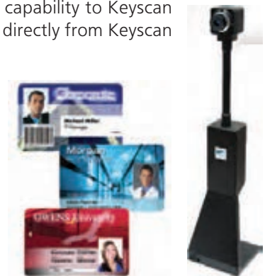
Requires card printer

† may require software module or license sold separately