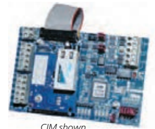
CIM shown with NETCOM2P

The CIM also includes enhanced device-based diagnostics and improved communication speeds.