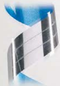
MaTriX Tape Technology

The patent pending MaTriX Technology embedded in the TX6A-SD™ 10Gig™ Copper Cabling System is constructed of discontinuous metallic elements that provide a very high degree of alien crosstalk suppression. This system for unshielded twisted pair cabling rivals the performance of a shielded system without the need for bonding and grounding and eliminates the concern for shield current flow arising from ground potential differences. The resulting channel performance eliminates the time and cost associated with cumbersome alien crosstalk field testing, providing an optimized alternative for deploying 10GBASE-T channel links up to 70 meters.