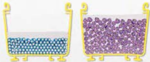
Panduit's Small Diameter Category 6A Cabling vs. Industry standard Category 6A Cabling

Panduit's small diameter Category 6A UTP Copper Cabling System with MaTriX Technology is a cost effective, cabling system that is fully compliant up to 70 meters. This high performance cabling system is comprised of unshielded twisted pair horizontal cable and patch cords which utilize 26 AWG copper conductors and patent pending MaTriX Technology to suppress alien crosstalk. Panduit® TX6A-SD™ Cabling requires 50% less routing space than standard Category 6A cables making it an ideal solution for cable intensive data centers.