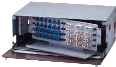
AX100115 FiberExpress (4U) Rack Mount Patch Panel