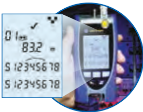
Wiremap with length