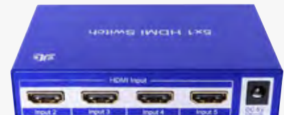
rear of unit