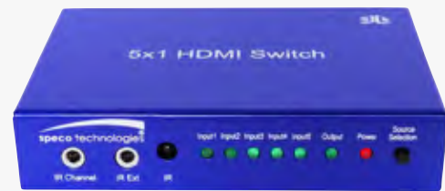
front of unit