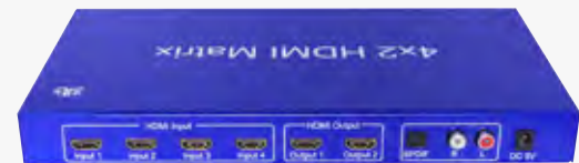
rear of unit