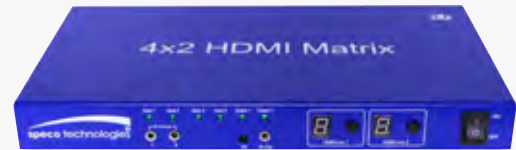
front of unit