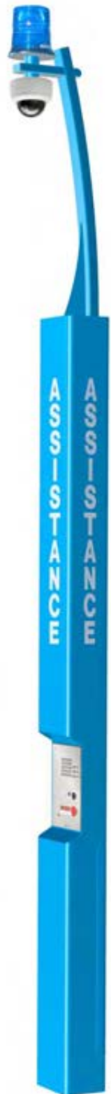
Shown on ETP-MTE with VOIP-500D