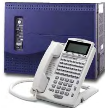
PBX-64 with PBX-PHONE