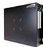
LSPSWMKIT Wall Mounting Kit