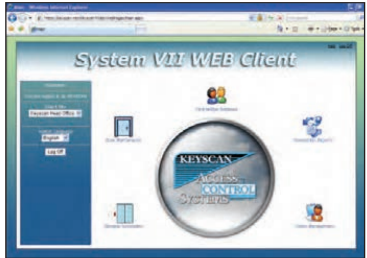
K-WEB Home Page

The power and flexibility of Keyscan Hosted Services and K-WEB module provides organizations the ability to manage their facility's access control systems.