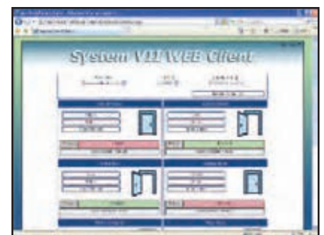
Door status control

Dealers and integrators may choose to create a 'turnkey' offering and provide a one-stop management of their customers access control systems contributing to increased RMR.