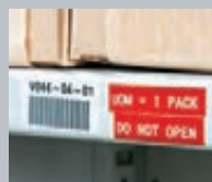
Facility & Safety Identification