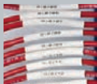
PermaSleeve® Wire Marking Sleeves