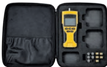
(Products not included)