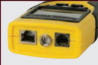
RJ45, F-Connector and RJ11/12 Jacks