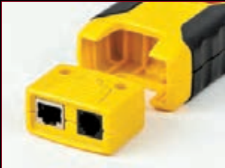
Self Storing Remote