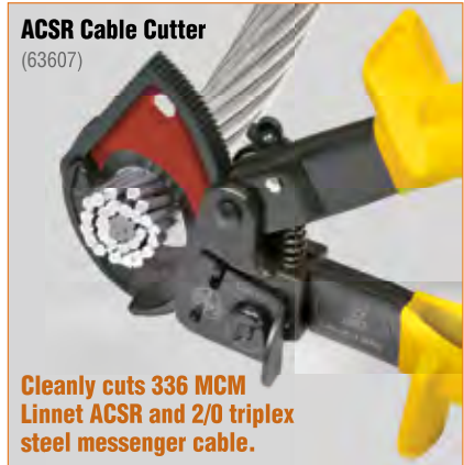
Cleanly cuts 336 MCM Linnet ACSR and 2/0 triplex steel messenger cable.