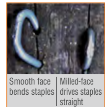
Smooth face bends staples Milled-face drives staples straight