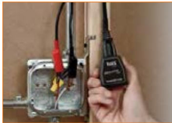
Alligator Clip Adapter for Bare Wires Kit 69411