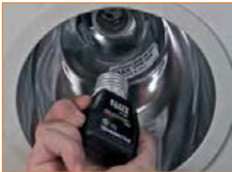
Light Socket Adapter