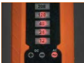
Bright Red LEDs Indicate Voltage