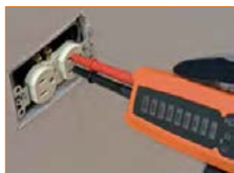
Measure Tamper-Resistant Outlets

UL 61010-1 2nd edition UL 61010-31 2nd edition CAN/CSA C22.2 No. 61010-01 CAN/CSA C22.2 No. 61010-031