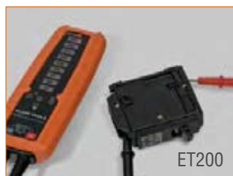
Check Circuit Breaker Continuity