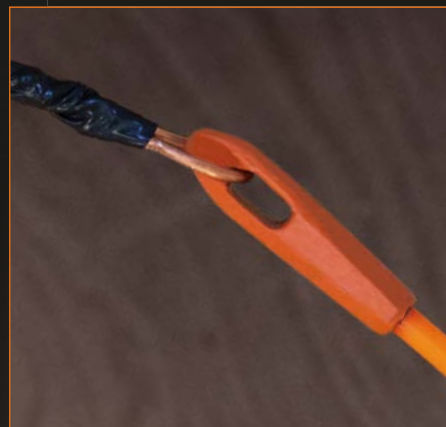
STREAMLINED DURABLE TIP