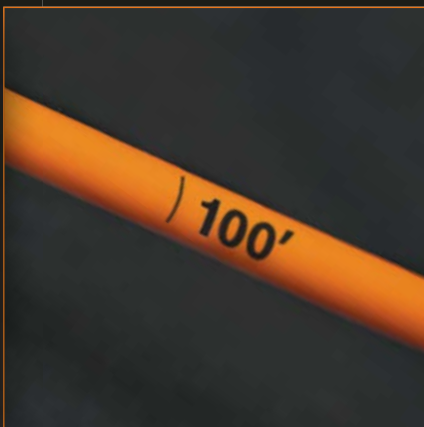
PERMANENT 1' MARKINGS