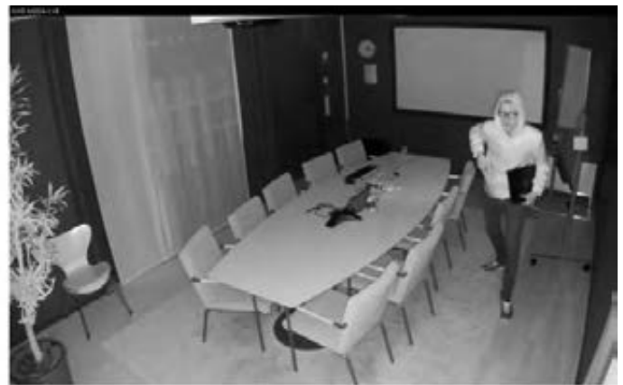
The above images from AXIS M3024-LVE—depicting the same scenario of a man with a small flashlight in a dark room—show the difference that IR illumination makes for surveillance in the dark. The image at left is without the use of IR illuminators. The image at right uses IR light from the camera's built-in IR LEDs. IR light is invisible to the human eye but visible to the camera.