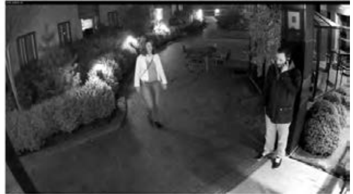
The above images from AXIS M3025-VE illustrate the camera's day/night functionality: at left, day mode; at right, night mode.