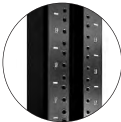
Rack-mount units (U) simplify equipment installation