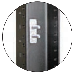
Ground Studs located directly on rack channel, speeds installation