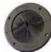
Round Grommet, 2 Sizes For Small Cable Bundles

Unsealed cable openings in access floor environments allow valuable conditioned air to bypass equipment. Bypass airflow contributes to hot spots, cooling unit inefficiencies and increased infrastructure costs. To reduce bypass airflow and improve data center cooling, block unsealed cable holes with KoldLok® Raised Floor Grommets.