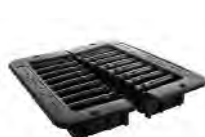
KoldLok Wave™ Split Integral Grommet For New Installations

Note: Large and Extra-Large Surface-Mount Grommets include grommets and steel plates which ship in separate boxes. Shipping Weights are for 10 each; P/N (-002).