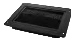
Integral Raised Floor Grommet*, 2 Styles For New Installations