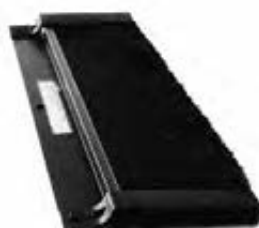
Extended Brush Raised Floor Grommet*, 2 Sizes For Large Cable Openings