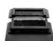
Large & Extra-Large Surface-Mount Raised Floor Grommet (13677 shown) For Existing Installations