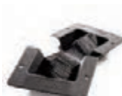
Mini Grommet For Small Cable Bundles