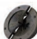
Round Grommet (13874-001 shown) For Small Cable Bundles