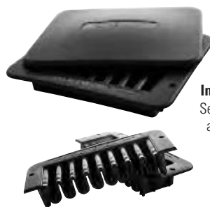
KoldLok Wave™ Split Integral Grommet and Cover Seals space around cables with a solid, flexible wave shaped thermoplastic elastomer material.