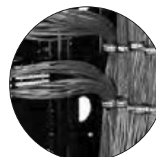
Unique fins support large bundles of cable

800-834-4969 in U.S. & Canada • www.chatsworth.com