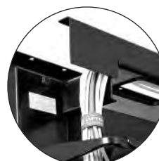
Integrated top jumper trough provides smooth transition

X=color: 7=Black, E=Glacier White. 55100-703 and 55104-701 available in black only.