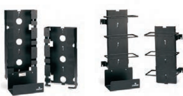
Basic Mounting Frame Kits include three 100-pair bases, mounting frame, cable tray, connector blocks, three horizontal cord managers, label strip holders, and white label strips.

For wall mount 110 cross-connections requiring high densities and additional cable access within a compact space. Mount to walls or backboards in building entrance facilities, telecommunications closets and equipment rooms.