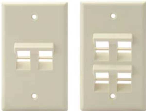
Pictured: 41081-2TP (left), 41081-4TP (right)

Field-configurable angled wallplates accept QuickPort® snap-in modules to support multimedia applications with 2- or 4-ports. Use where an economical one-piece, single-gang flush-mount housing is desired. Three color choices, with color-matched screws.