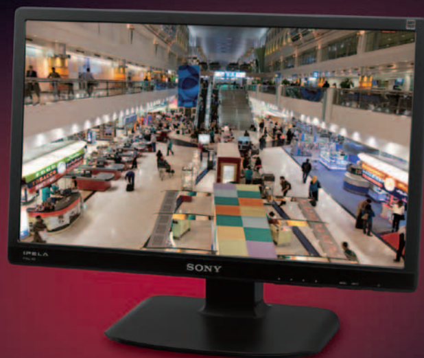
The monitor stand is optional. Screen image simulated.