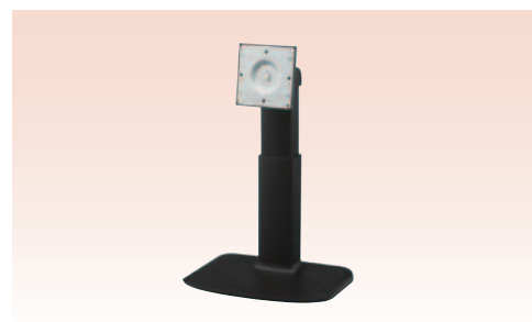
SSMA-SU10 Monitor Stand

Note: optional accessories are sold separately