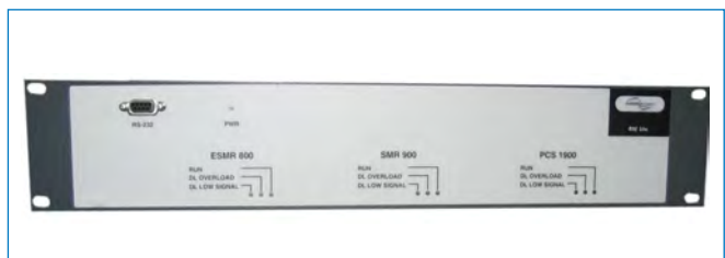
RIU-Lite | Figure 2