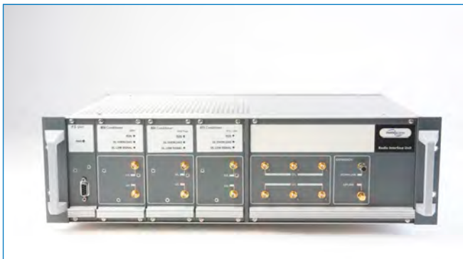
RIU-IM | Figure 1