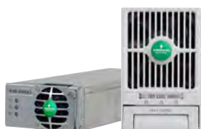
High-Efficiency eSure™ Rectifiers R48-2000e3 (left) & R48-3500e (right)

High efficiency 3500 watt and 2000 watt constant power rectifiers are available to cover a wide range of applications.