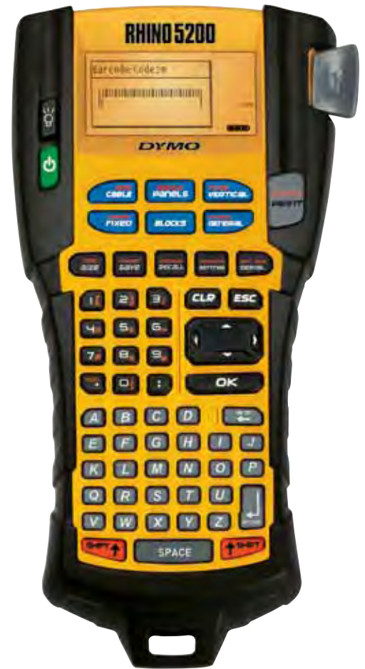
Hard Case Kit (see back for details)

It's just as easy to print module and fixed-length labels, horizontal and vertical wire wraps, terminal and 110 blocks and much more. Print Code 39 and Code 128 barcodes. Access 100+ industry symbols, fractions and punctuation marks with a few quick keystrokes. Add the optional quick-charging lithium-ion battery for uninterrupted productivity.