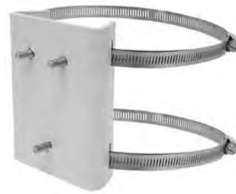
PA101 POLE ADAPTER MOUNT