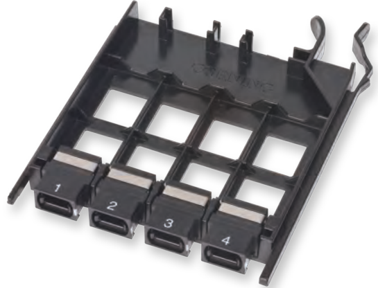
Part Number: EDGE-CP48-90