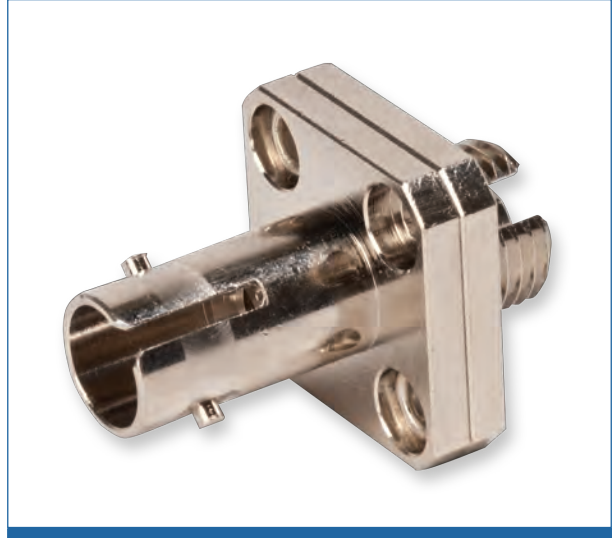
Part Number: ADP-STFC-MMXSF-NLS