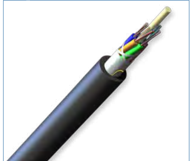
Part Number: 048TUF-T4180D20