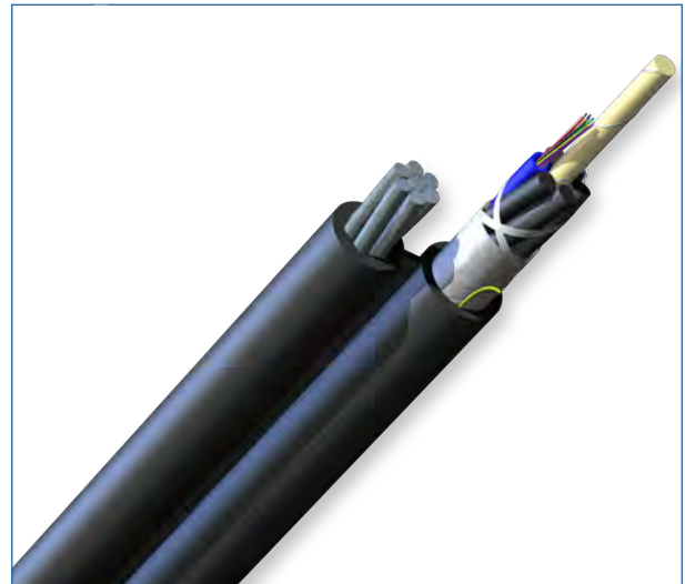
Part Number: 012TUA-T4131D20

Design and Test Criteria ANSI/ICEA S-87-640