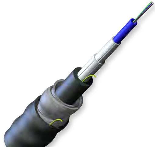
Part Number: 006TSF-T4180DA1