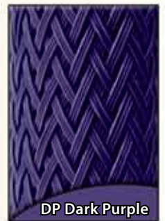
DP Dark Purple