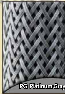
PG Platinum Gray