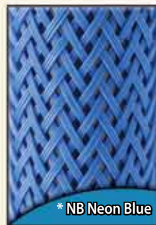
*NB Neon Blue