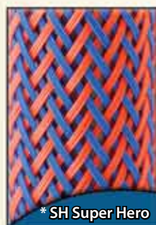
*SH Super Hero