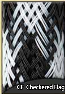
CF Checkered Flag