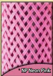
*NP Neon Pink