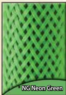
*NG Neon Green