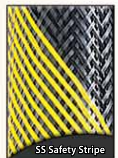
SS Safety Stripe