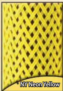
*NY Neon Yellow