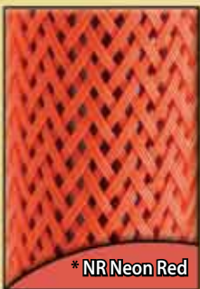
*NR Neon Red