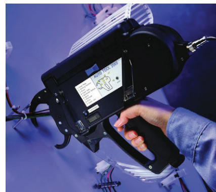
AT2060 Technical Specifications

HellermannTyton's AT2060 automatically installs cable ties for bundles up to 1-1/4". The many ergonomic benefits include easy trigger depression and low weight that reduces operator effort and strain. Operation and maintenance of the tool are enhanced by the self-diagnostic LED panel located on the AT2060.