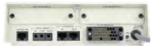
TSU ESP Back

Specifications subject to change without notice. T-Watch PRO and TSU ESP are trademarks of ADTRAN, Inc. ADTRAN is a registered trademark of ADTRAN, Inc. HP OpenView is a registered trademark of Hewlett Packard Company. NetView is a registered trademark of IBM Corporation. SunNet Manager is a registered trademark of Sun Microsystems, Inc. Windows is a registered trademark of Microsoft Corporation. All registered trademarks and trademarks mentioned in this publication are the property of their respective owners.