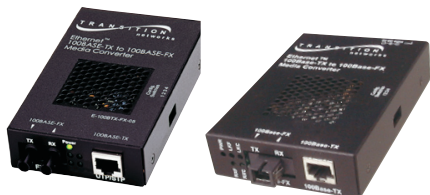
single fiber model