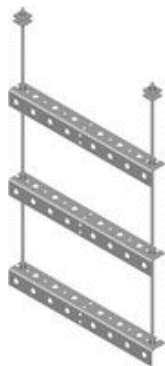
WB-TT12 Trapeze Kit, 12 in wide, three rungs