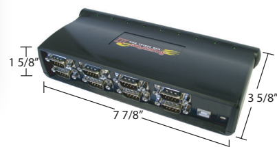
RocketPort Serial Hub Dimensions