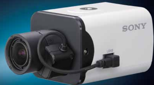
Shown with optional CS mount lens