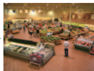
2nd Streaming VGA video of a cropped area