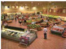
1st Streaming SVGA video of a whole