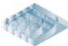
Warehouse 50' Full Range