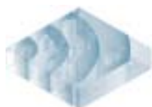
Restaurant 35' Full Range