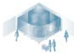
Pharmacy 18' Range