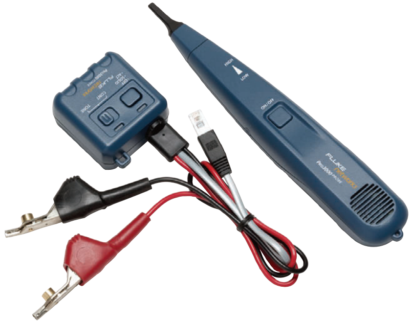
Pro3000 Toner and Probe

The Pro3000 Analog Tone and Probe are your best choice for toning and tracing wire on non-active networks, and specifically for identifying individual pairs with SmartTone™ technology. Angled bed-of-nails clips allow easy access to individual wires, and the RJ11 connector is ideal for use on telephone jacks. The large loud speaker on the probe allows you to hear through drywall, wood or other enclosures to find wires quickly and easily. You can send this loud tone up to 10 miles on most cables! Attach the nylon pouch to your belt, and you will be equipped for any wire identification job.